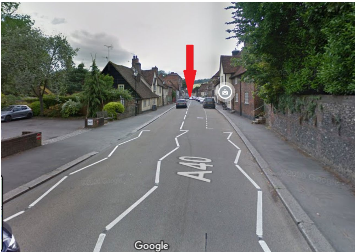
Figure 2 - West Wycombe High Street centre line markings